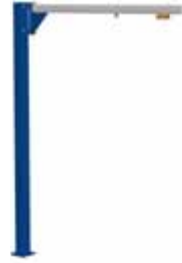
Low-built arm in aluminium LR113 up to 25 kg

LRAVU low-built wall jib cranes LRAVU low-built column jib cranes