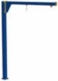
Low-built arm in steel LR120 up to 80 kg

UVM low-built wall jib cranes UPM low-built column jib cranes